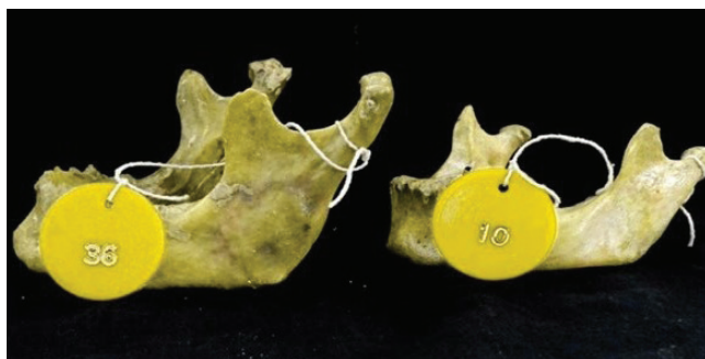
Figure 3. Image of maximum and minimum breadth of ramus of mandible.