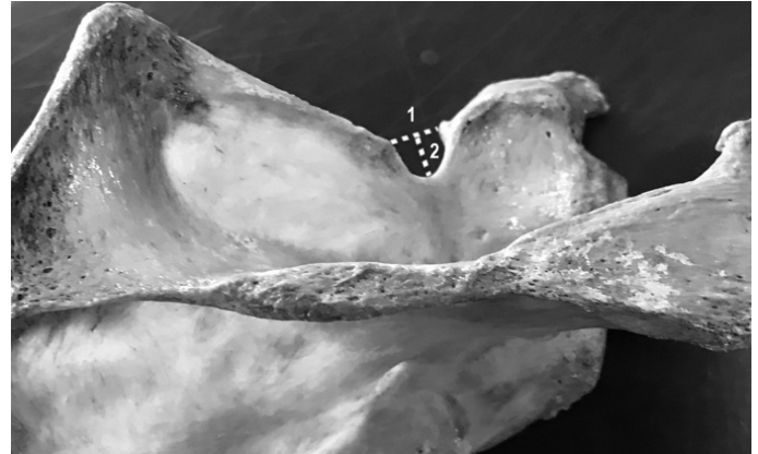
Figure 1. Dimensions of the suprascapular notch: 1 - Transverse diameter (TD); 2 - Vertical diameter (VD).

The study was approved by the Ceará's Federal University Ethics Committee (CAAE: 15006918.0.0000.5054)