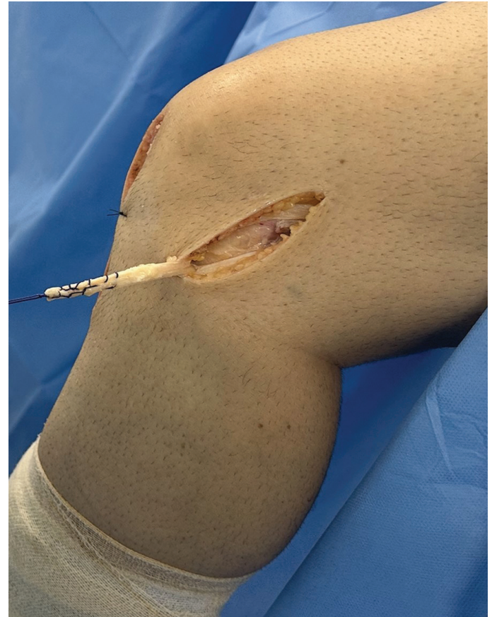
Figure 2. Iliotibial band as ALL graft.

The results showed that the ALL is not present at International Anatomical Terminology, although this ligament is known in clinical context. The searches in health databases revealed that the ALL had been described since 1879 but it was characterized as ligament only in 2013 1 .